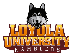
2015 CBI Champions

The 2018 NCAA Tournament was a showcase for CBI success. In 2015, Loyola Chicago won the CBI in its first postseason appearance since 1985. In 2016, Nevada won the CBI. Both programs met in the Sweet 16 of the NCAA Tournament that season with Loyola Chicago taking a 69-68 decision to advance to the Elite 8. The Ramblers followed that with a 78-62 win over Kansas State to advance to the Final Four. The Ramblers join VCU as a CBI champion (2010) that played in the Final Four (2011).