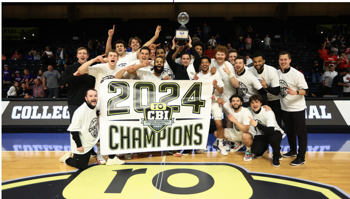
2024 College Basketball Invitational champions Seattle