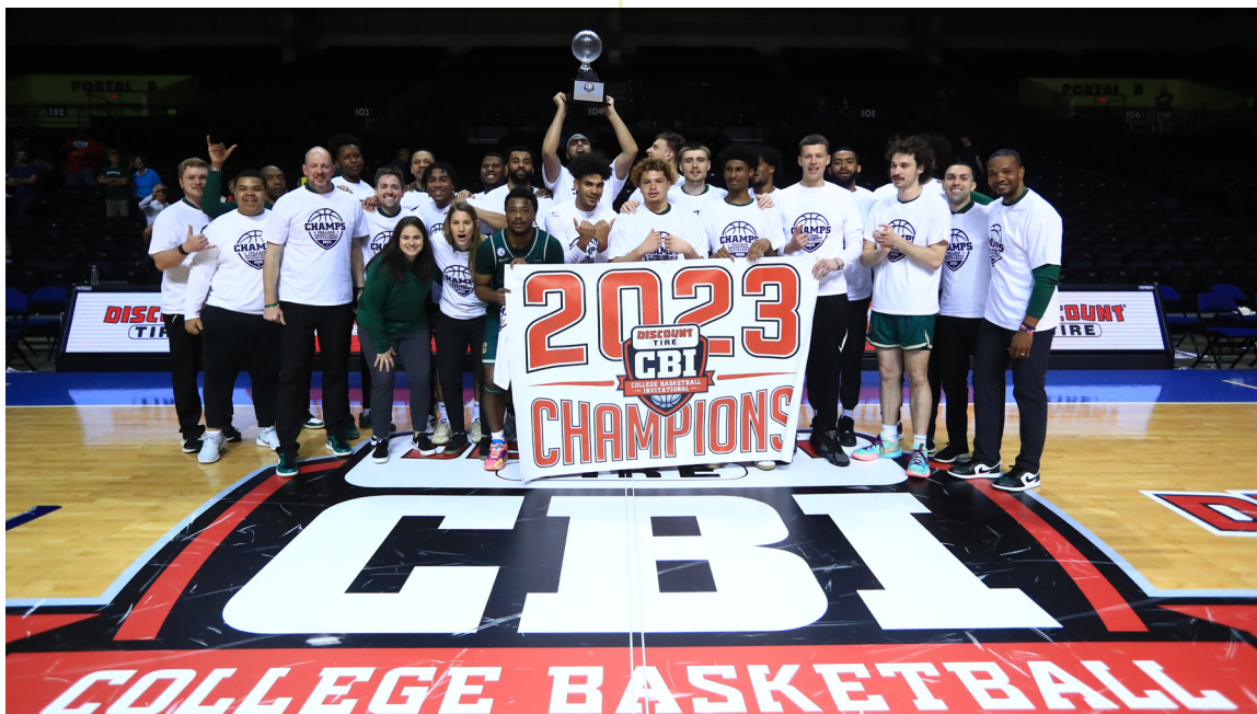
2023 College Basketball Invitational champions Charlotte