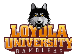
2015 CBI Champions

The 2018 NCAA Tournament was a showcase for CBI success. In 2015, Loyola Chicago won the CBI in its first postseason appearance since 1985. In 2016, Nevada won the CBI. Both programs met in the Sweet 16 of the NCAA Tournament that season with Loyola Chicago taking a 69-68 decision to advance to the Elite 8. The Ramblers followed that with a 78-62 win over Kansas State to advance to the Final Four. The Ramblers join VCU as a CBI champion (2010) that played in the Final Four (2011).